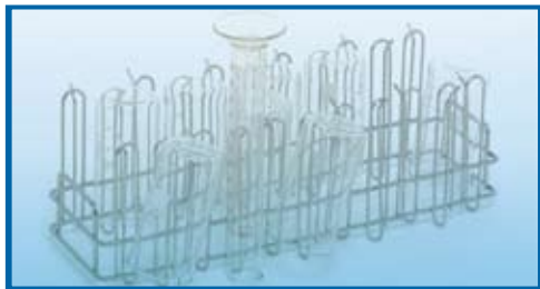
22 Clip Rack 7250348

Universal Erlenmeyer flask/beaker accessory recommended for capacities up to 1000mL.