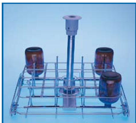
Injection Jet Rack for Bottles LB161

Injection Jet Rack for bottles for Micro or Pharma use, available in six versions.