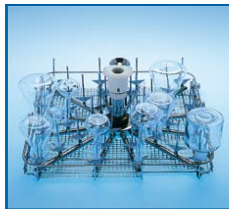
Upper Hollow Jet Rack LM40S

Upper level rack for washing narrow-necked glassware by internal injection. It is positioned on the top level of the machine. Capacity 40 items, for glassware with a maximum height of 225mm. Standard equipment includes 140mm height nozzles.