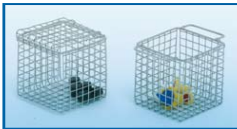
Square Baskets 100x100x100mm