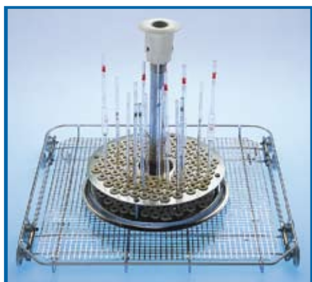
Pipette Washer Disk LPT100

Accessory to wash 100 pipettes with 1 to 20 mL capacities and height up to 450mm. The pipette disk must be fitted onto a rack for quick loading and unloading access.