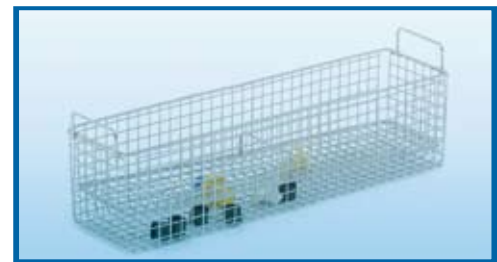
Rectangular Basket 7251228a