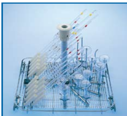
Flask/Pipette Rack LPM20/20

Injection washing rack for both pipettes and flasks. Features 20 positions for pipettes with height measurements of up to 550mm and 20 positions for narrow-necked glassware with a maximum height of 490mm.