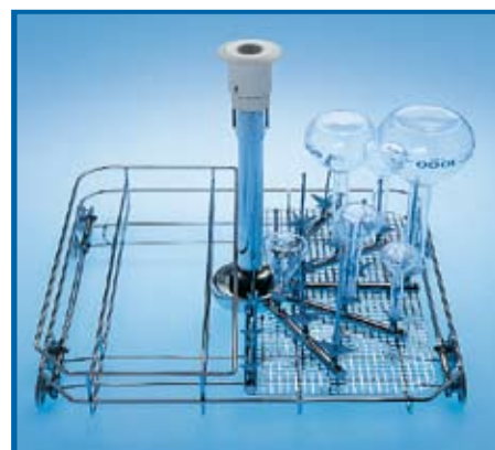
Flask Washing Rack LM20

1-tier Injection Rack for 100 tubes KP100