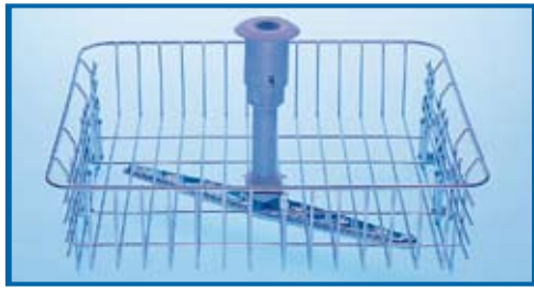
Upper Basket with sprayer CS1

Fits upper level of washer to support racks of various configurations. Features Spray arm for upper level washing.