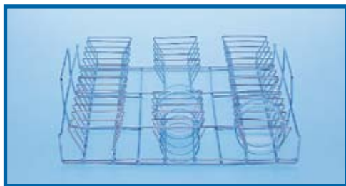
Petri Dish Holders

Rolls into lower position in washer to support baskets or racks of various configurations.