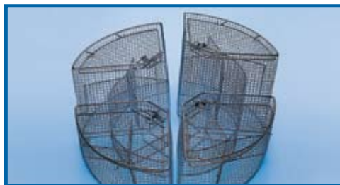
Quarter Basket 150mmH 7251550a