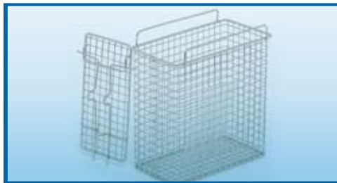
Basket for Test Tubes 7250906

Clip Racks are used for conical flasks, beakers, measuring cylinders, etc.