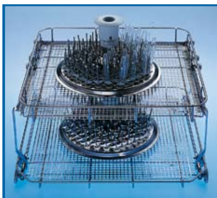
2-tier Injection Rack for Test Tubes KP200

Two level trolley for washing tapering and straight tubes by internal injection. Maximum 200 tubes. Single level version also available.