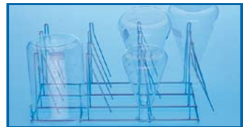
Spring Peg Rack SB28

Please note: This picture displays a set of four (not sold as whole unit)