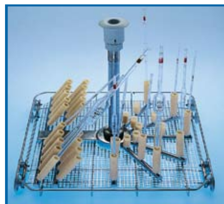
Pipette rack LPV40

LPM20/20-DS: Rack with Fan forced Drying.