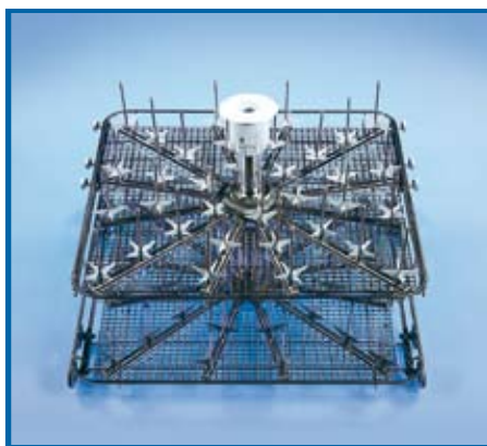
2-tier Hollow Jet Rack LM80

Two-level rack for washing narrow-necked glassware by internal injection. Capacity 68 items, for glassware with a maximum height of 225mm. Standard equipment includes 140mm height nozzles.