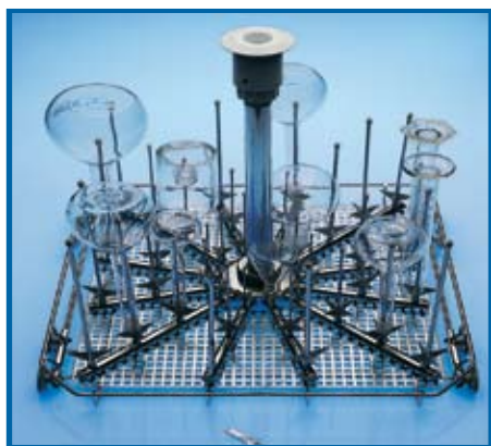
Hollow Jet Rack LM40

Universal jet rack for washing narrow-necked glassware, round bottom flasks and measuring cylinders. Eight different sizes of interchangeable nozzles. Maximum capacity 40 items.